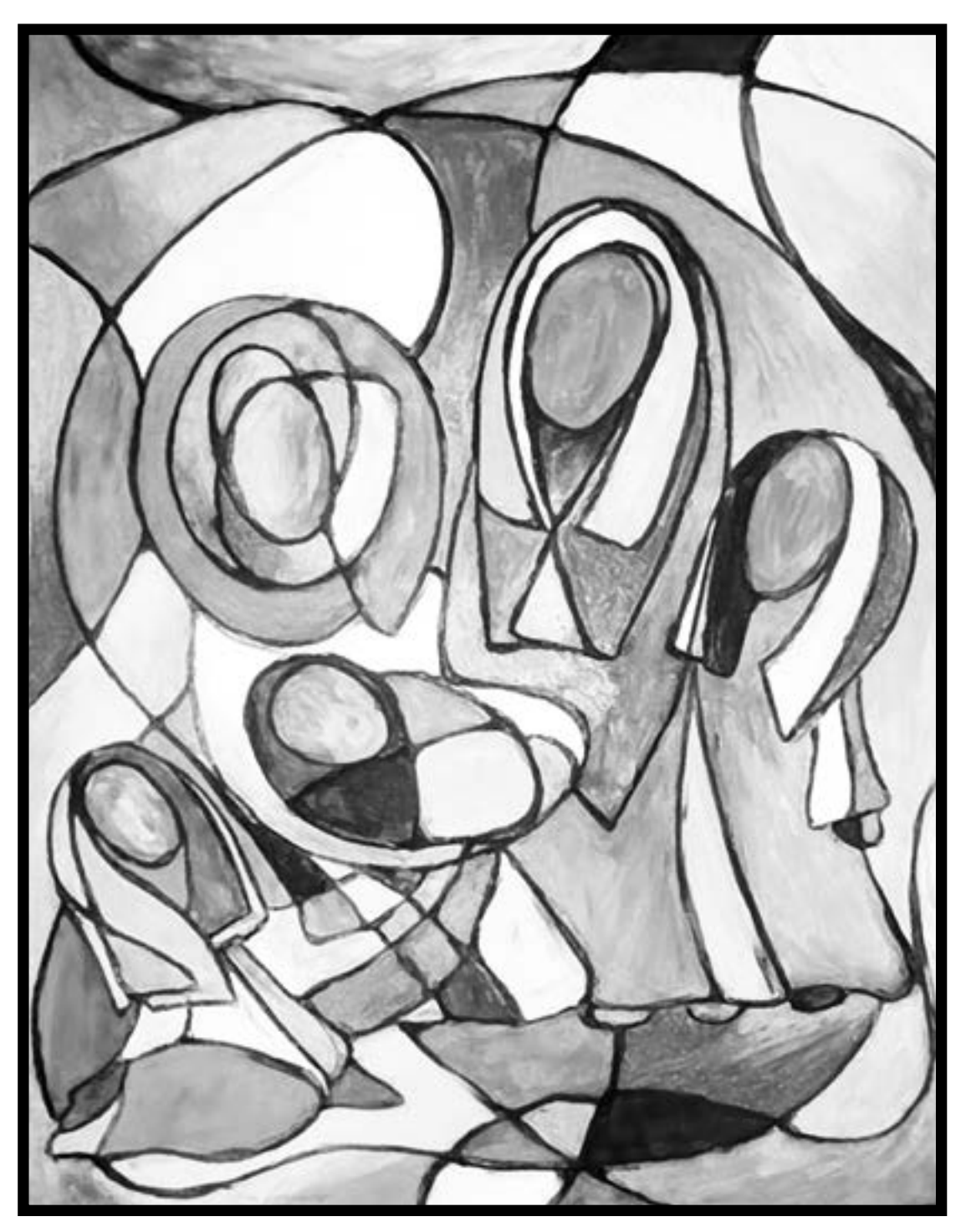
Who is this Messiah?